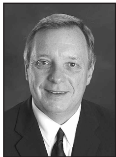
Senator Richard Durbin will be this year's honoree at the 2008 Best Friend Award Night on April 18, 2008.

116 West Illinois Street, Suite 5E Chicago, IL 60610 Telephone 312-595-0649 Fax 312-595-0939 www.KidsInDanger.org email@KidsInDanger.org