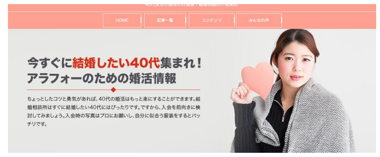
Laura Ashley Girl's Dress CPSC Link Directs to Unrelated Website

This obstructs the recall process altogether, as consumers cannot rely on CPSC links and must seek out information on their own, voiding the purpose of providing recall information. As a relied-upon governmental office, the CPSC must improve accuracy in linking to company websites. Also, several websites with links only link back to the CPSC page, which sends the user on a pointless loop in seeking remedy for a recall. Some company websites go to great lengths to obscure their recall notice page, assuming they have one at all, making it harder on the consumer to find information readily when researching recall information.