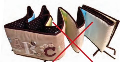
Crib bumper pads